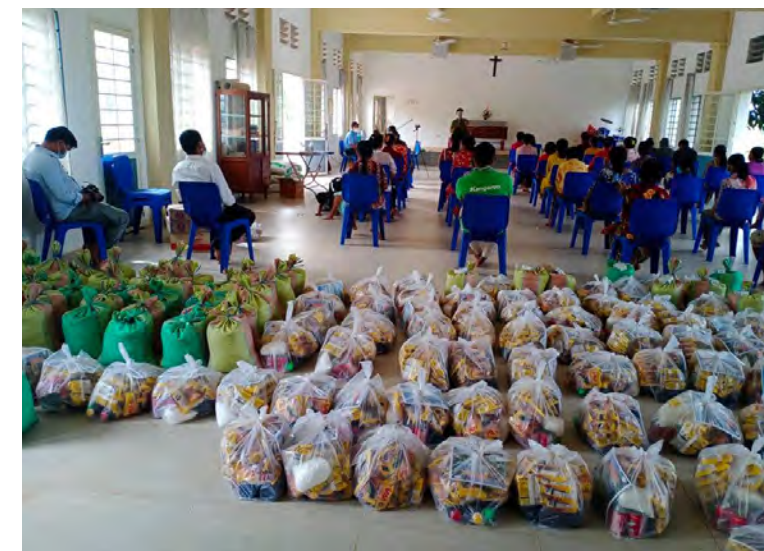
Food distribution in Svay Rieng