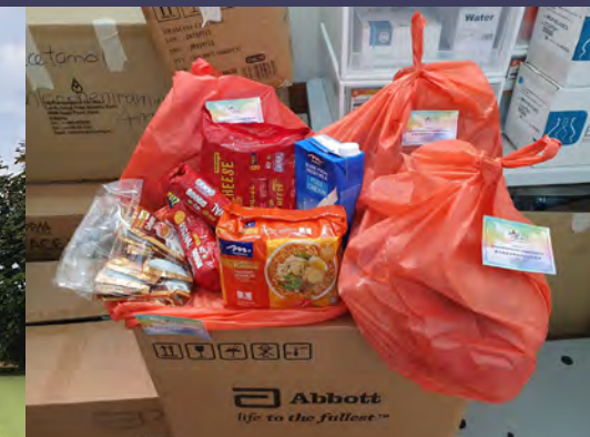
SACS care packages for our migrant workers