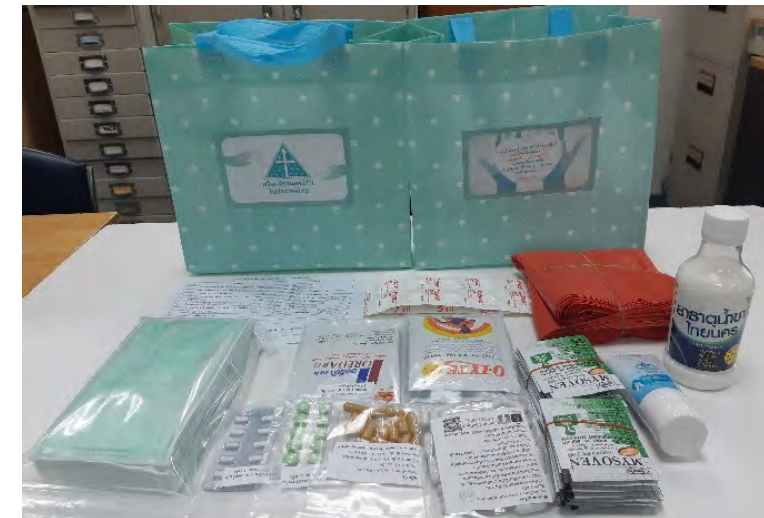
"Shared Love" Care Pack distributed in the Deanery of Thailand

The Deanery of Thailand's COVID-19 Task Force initiated a project to distribute "Shared Love" care packs to members who contracted COVID-19. Each care pack contained medication, face masks, hand sanitizers, biohazard bags as well as equipment such as oximeters, thermometers, and ART kits. The Task Force also provided information on how to notify and register their details with the authorities in order to receive timely information and updates from the government as well as to have a teleconsultation session with the doctors.