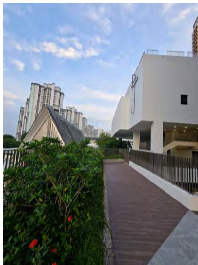
Level 4 walkway connecting the Nursing Home to Childcare Centre

For a virtual tour of the Home, please visit www.sjsnvillage.org.sg .