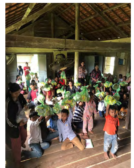
Deanery of Cambodia during a Food Relief session at Ksart Borei, Pursat