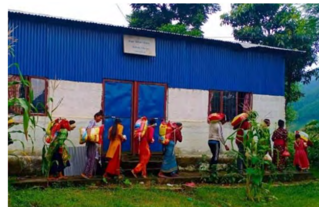
COVID-19 Relief in Nepal