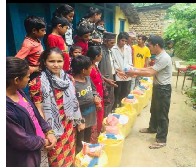
COVID-19 Relief in Nepal