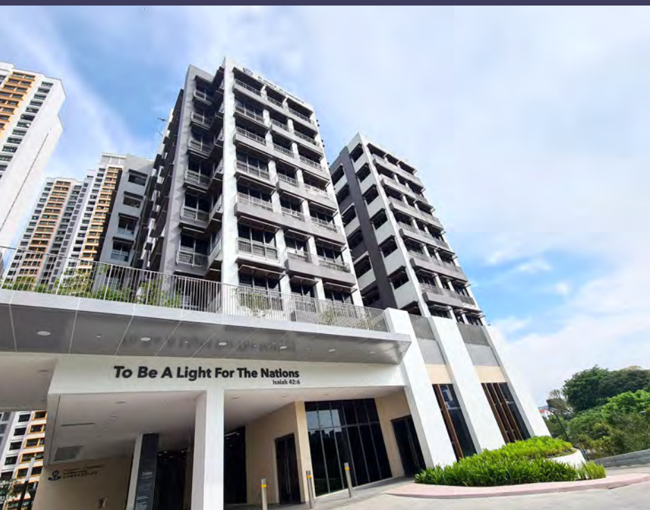
Nursing Home Facade

By St. John's - St. Margaret's Nursing Home Corporate Communications