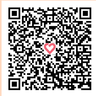
52nd Coy at Pei Tong Primary School